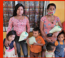
Junior High graduates with iPads Elementary Graduates with phones University graduate Milk recipients

Celebrating Christmas with the youth for their birthdays, graduations from Elementary, Junior High and University and those with the best grades for all levels of education. Celebrating the Women with 66 Christmas baskets of food as well as a chicken. Celebrating 20 adult graduates from our adult education program. Being thankful to be able to provide nutritional milk to those families in need. The best celebration is of Him whom our hearts love and whom we thank for all we have in this life and the life to come.