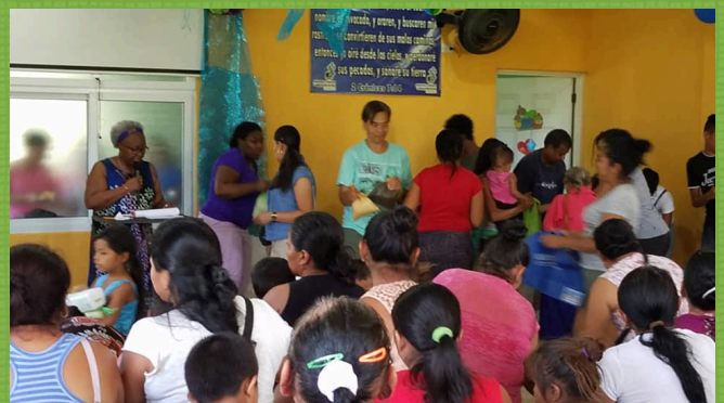
Giving out beans, rice and corn meal