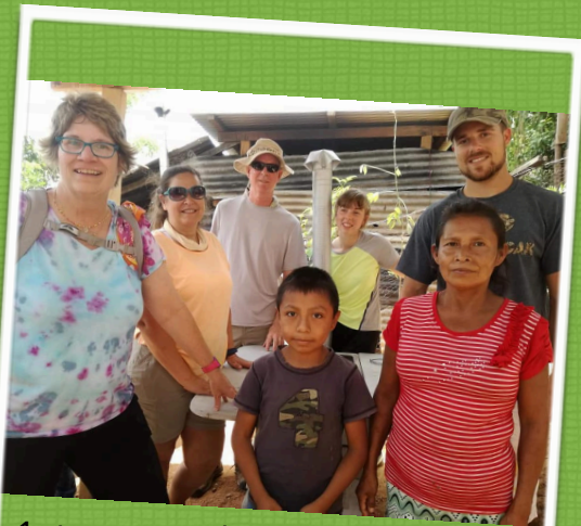
1st group stove

ISAIAH 9:2 “The people who have walked in darkness have seen a great light; those who dwelt in the land of the shadow of death, upon them a light has shone.”